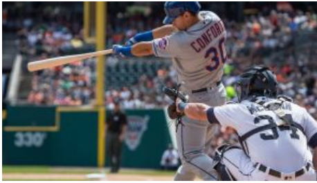
Mets hope HR gets Conforto out of slump